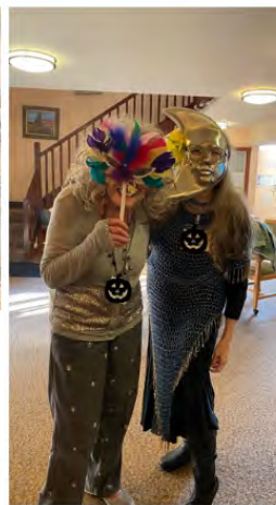
Halloween At The Woods