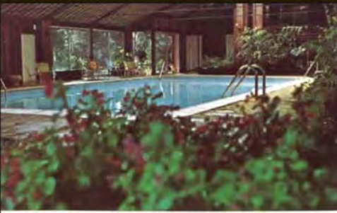
The heated pool and therapeutic whirlpool are always open to members and their guests.