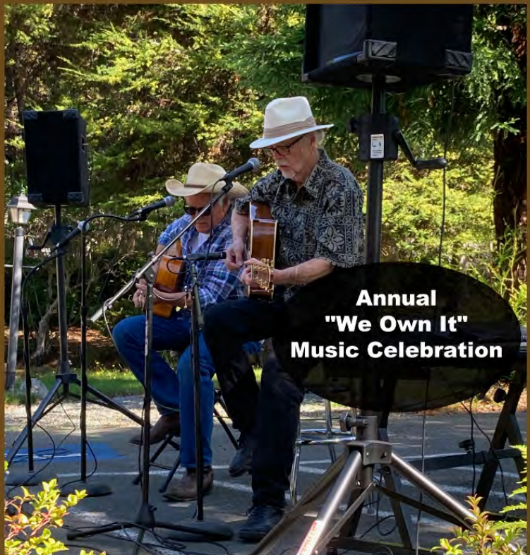
Annual "We Own It" Music Celebration