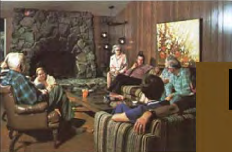
The clubhouse accommodates a library, social hall, pool room, lounge, craft room, large kitchen and card room.