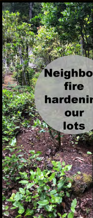
Neighbors fire hardening our lots