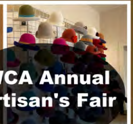
WCA Annual Artisan's Fair